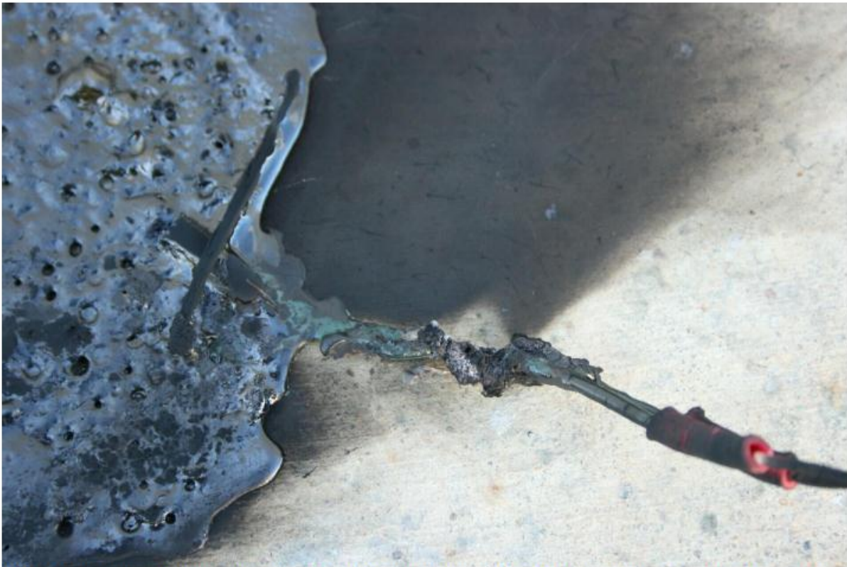
(U//FOUO) Figure 7. Close-up of the residue following the burn. Note the burned remains the match used to ignite the device after the electric igniter failed (left-center in picture), and the remains of the electrically initiated lamp connected to the wires.