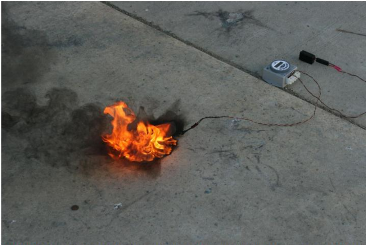
(U//FOUO) Figure3. During the burn, the 'Ember Bomb' burned with low intensity and produced dark-black smoke. Note the complete lack of ember production.