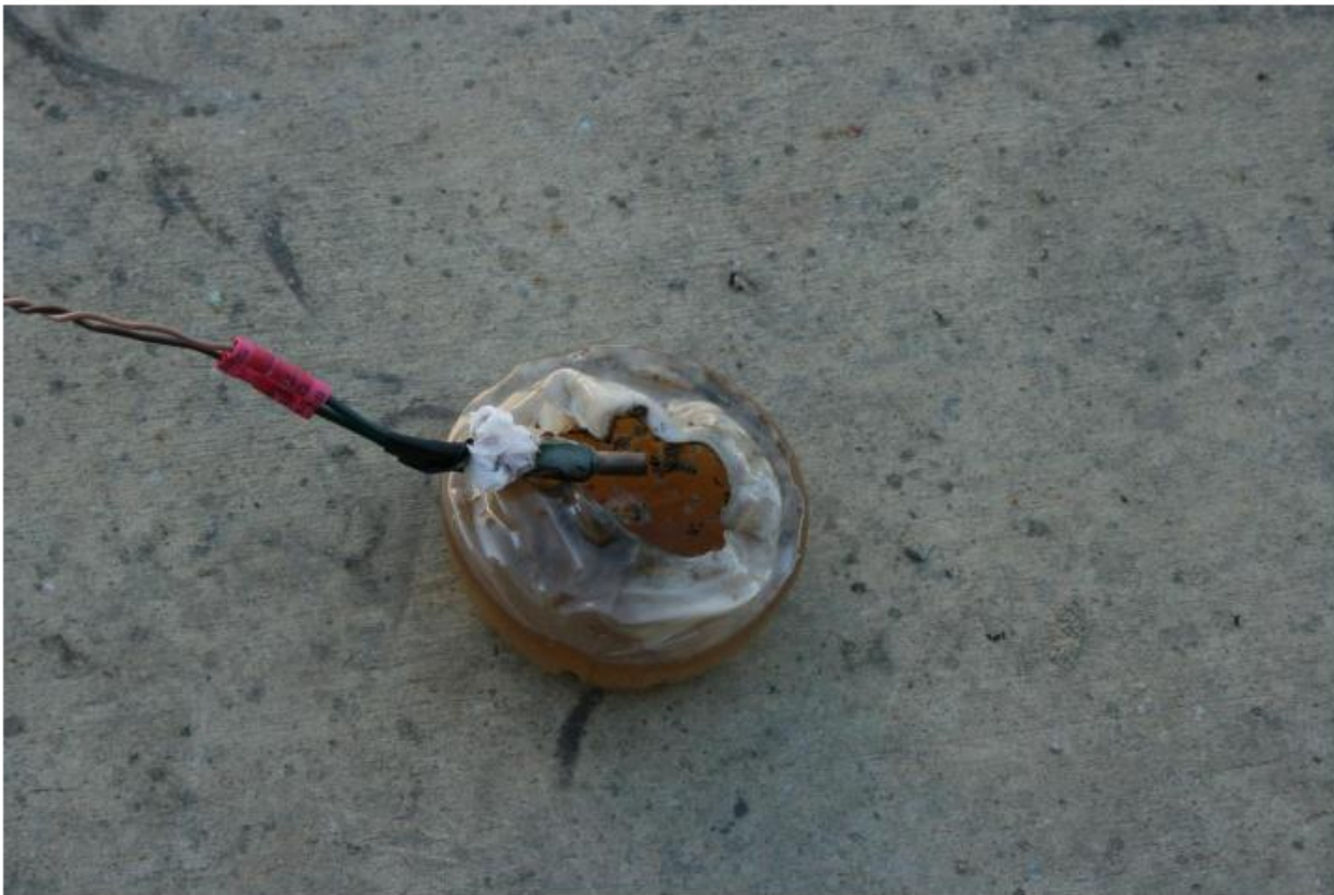
(U//FOUO) Figure 2. Container and fuel mixture following the failed ignition attempt.