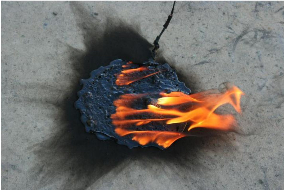
(U//FOUO) Figure 5. The device burned into an obsidian-like residue approximately 8-inches in diameter.