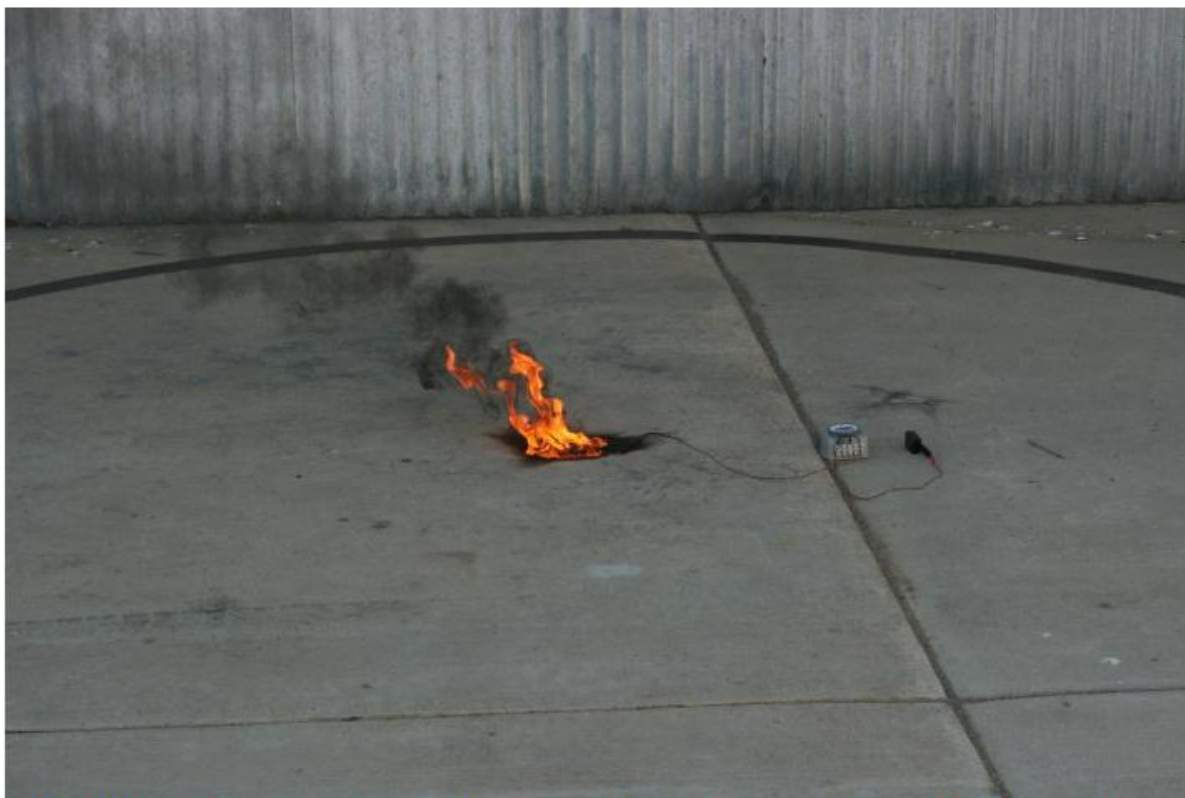
(U//FOUO) Figure 4. The device burned with the average intensity shown here. The duration of the burn was 11 minutes and 58 seconds.